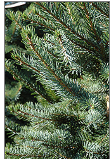
Brun's Spruce foliage