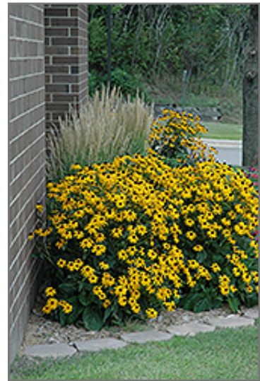
Goldsturm Coneflower in bloom