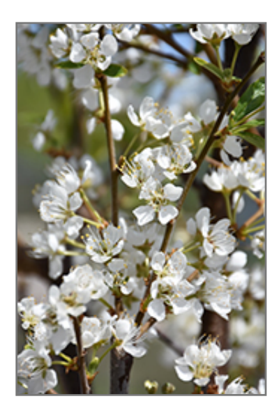
Toka Plum flowers