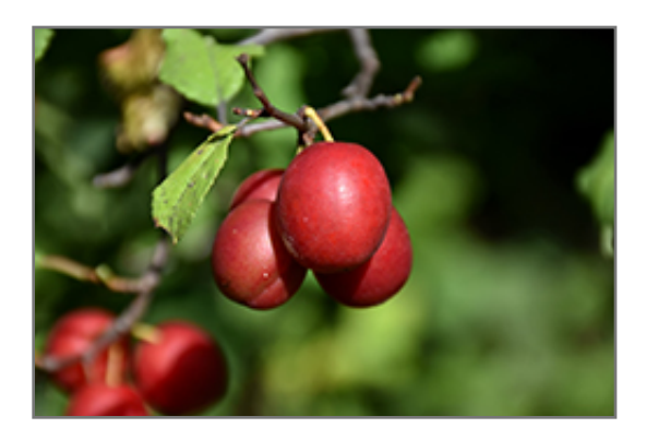
Toka Plum fruit