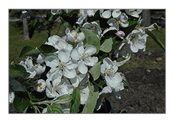
Fall Red Apple flowers

This tree is typically grown in a designated area of the yard because of its mature size and spread. It should only be grown in full sunlight. It prefers to grow in average to moist conditions, and shouldn't be allowed to dry out. It is not particular as to soil type or pH. It is highly tolerant of urban pollution and will even thrive in inner city environments. This particular variety is an interspecific hybrid.