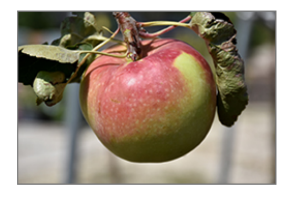
Fall Red Apple fruit

Fall Red Apple features showy clusters of lightly-scented white flowers with shell pink overtones along the branches in mid spring, which emerge from distinctive pink flower buds. It has forest green deciduous foliage. The pointy leaves turn yellow in fall. The fruits are showy ruby-red apples carried in abundance in early fall. The fruit can be messy if allowed to drop on the lawn or walkways, and may require occasional clean-up.