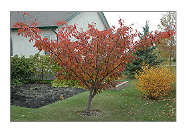
Pembina Plum in fall

The Pembina Plum can be pollinated by the Brookred Plum, Opata PLum or the Western Sandcherry Shrub.