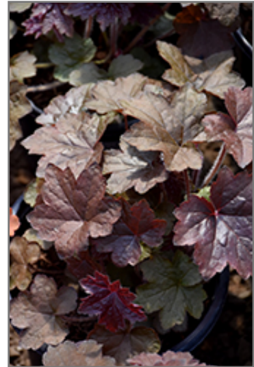
Palace Purple Coral Bells foliage