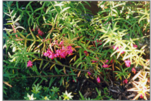
Turkestan Burning Bush flowers Photo courtesy of NetPS Plant Finder

This shrub performs well in both full sun and full shade. It is very adaptable to both dry and moist locations, and should do just fine under average home landscape conditions. It is not particular as to soil type or pH. It is highly tolerant of urban pollution and will even thrive in inner city environments. This is a selected variety of a species not originally from North America.