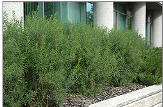
Turkestan Burning Bush