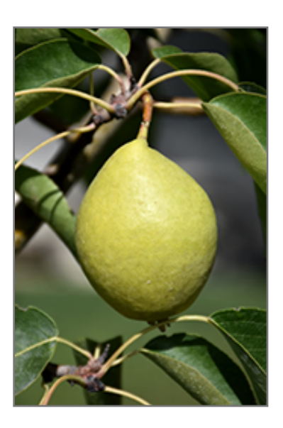
Early Gold Pear fruit

This is a dense deciduous tree with a shapely oval form. Its average texture blends into the landscape, but can be balanced by one or two finer or coarser trees or shrubs for an effective composition. This is a high maintenance plant that will require regular care and upkeep, and is best pruned in late winter once the threat of extreme cold has passed. Gardeners should be aware of the following characteristic(s) that may warrant special consideration;