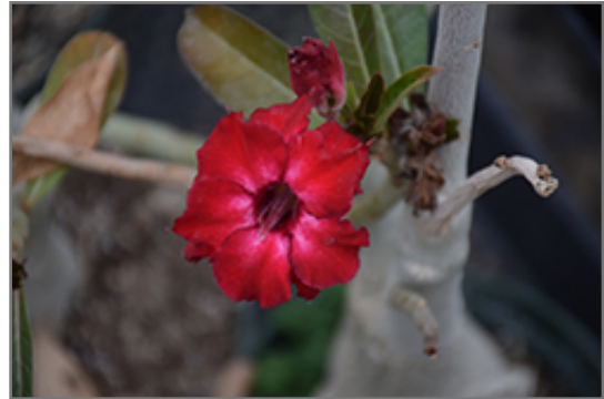
Double Waterfall Desert Rose flowers

Double Waterfall Desert Rose will grow to be about 6 feet tall at maturity, with a spread of 4 feet. It has a low canopy with a typical clearance of 1 foot from the ground, and is suitable for planting under power lines. It grows at a slow rate, and under ideal conditions can be expected to live for 40 years or more.